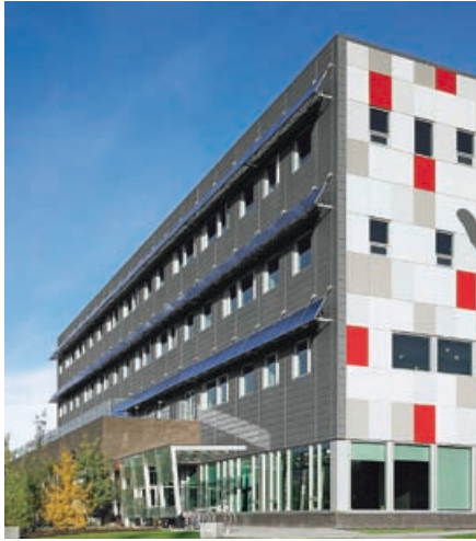
University of Calgary - Children's Development Centre, Calgary, Alberta, Canada LEED™ Platinum Certified - Kasian Architecture, Calgary